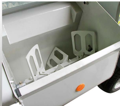
The hydraulic mixer provides plenty of well mixed material, even at the highest pumping speeds.