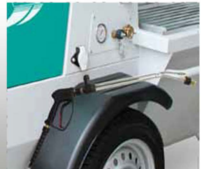
Hydraulically driven pressure washer comes standard.