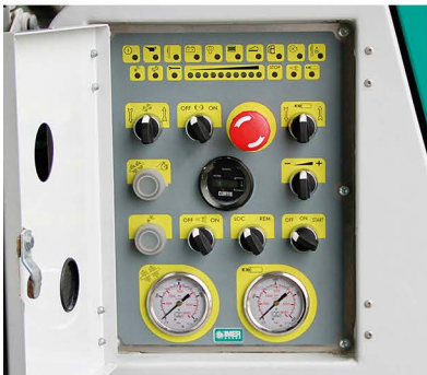
The control panel is simple yet intelligent.